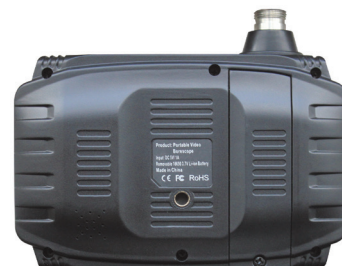
rear without rubberized housing protection