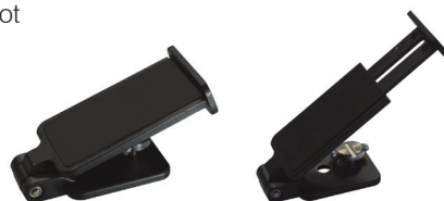
extendable table stand