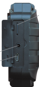
SD card slot TV connection mini USB connection