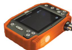
LED light (3 levels)