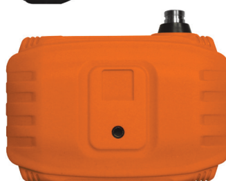
rear with rubberized housing protection