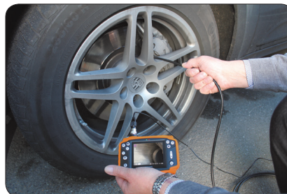
Example: brake discs control