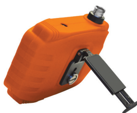
table stand with M6 thread